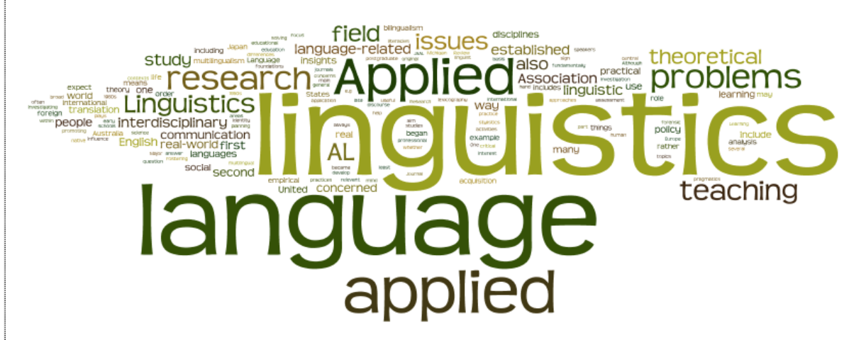
Benjamin Stewart / CC BY (https://creativecommons.org/licenses/by/3.0)