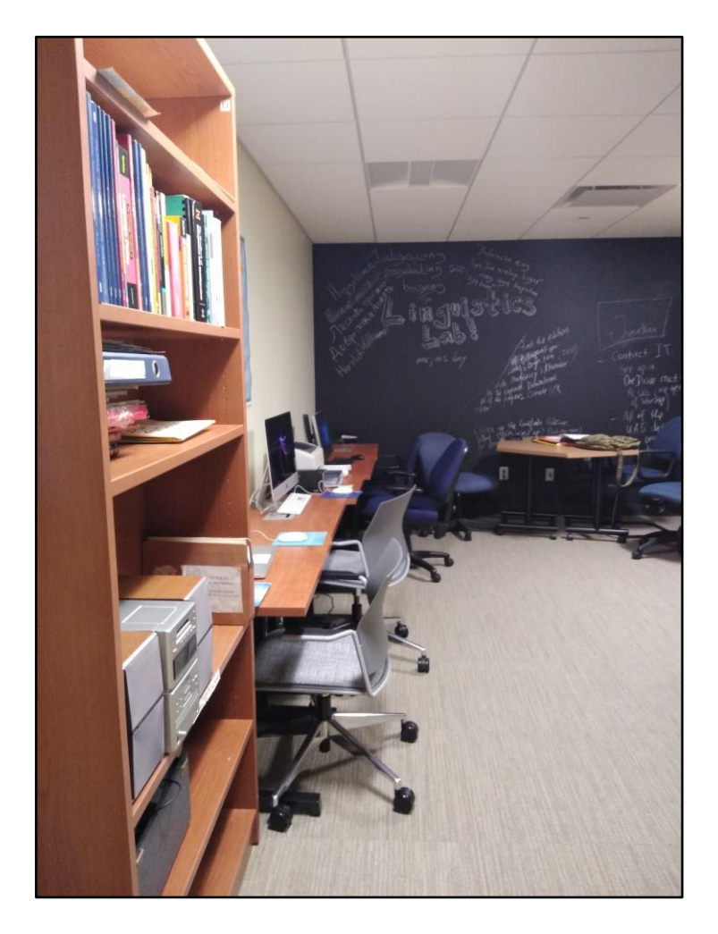
The Linguistics Lab in the newly renovated Willard/Diloreto Hall

A copy of a signed planned program form, completed in consultation with and approval of the academic advisor, is filed with the Graduate School for official approval. It is the student's responsibility once matriculated to communicate with the advisor and to work out a planned program. Failure to submit an approved plan of study may result in additional coursework and delay of graduation. Advising and pre-registration for any semester normally occur about midway through the preceding semester. Advisors are available during the school year when classes are in session. If the advisor is unavailable, the student should consult with the TESOL Program Coordinator or with the Chair of the English Department.