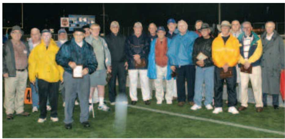
Undefeated football teams of '39 and '54 honored at halftime of Homecoming Day football game