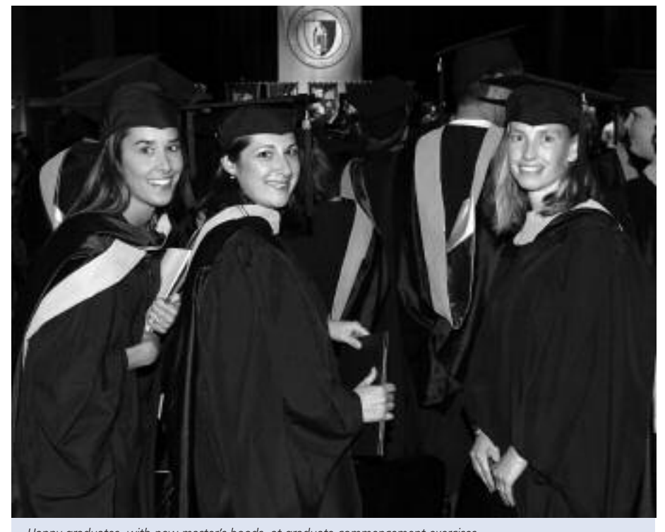
Happy graduates, with new master's hoods, at graduate commencement exercises

"My classes ranged from eight to about 25 students, so I never felt lost. That was especially important to me since I'd been out of school for 15 years."