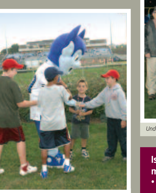
Future alumni scrimmage with the Blue Devil on Homecoming Day.