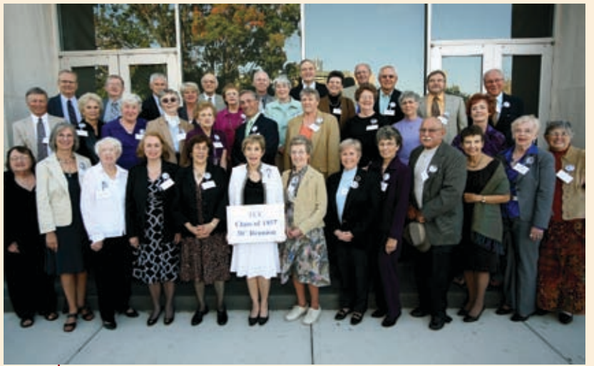
Class of 1957 at 50th reunion.