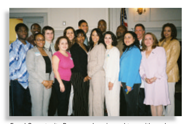
Equal Opportunity Program alumni caught up with each other at a reception on May 5, 2005.