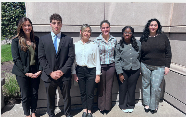
DEPARTMENT OF CRIMINOLOGY & CRIMINAL JUSTICE MOCK INTERVIEWS