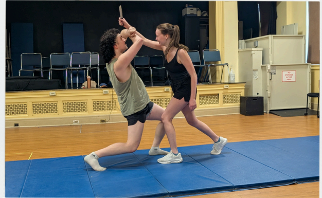
THEATRE DEPARTMENT'S STAGE COMBAT CLASS