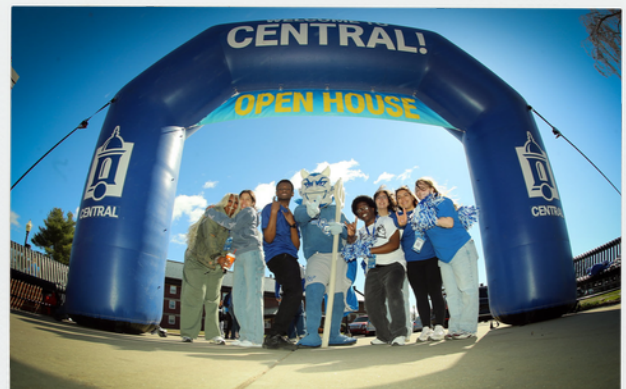
SPRING 2026: OPEN HOUSE