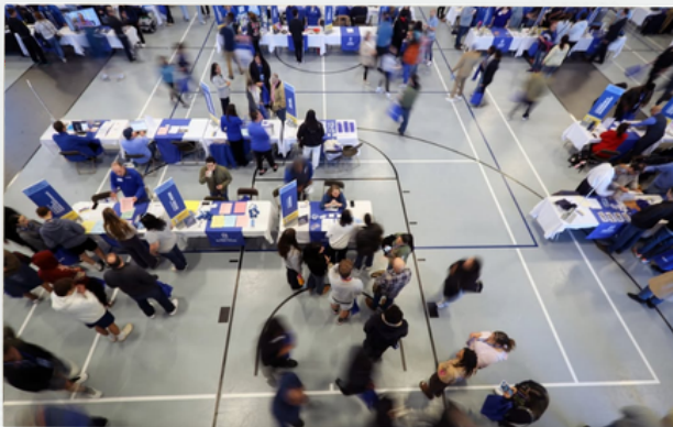
SPRING 2026: ACCEPTED STUDENTS DAY