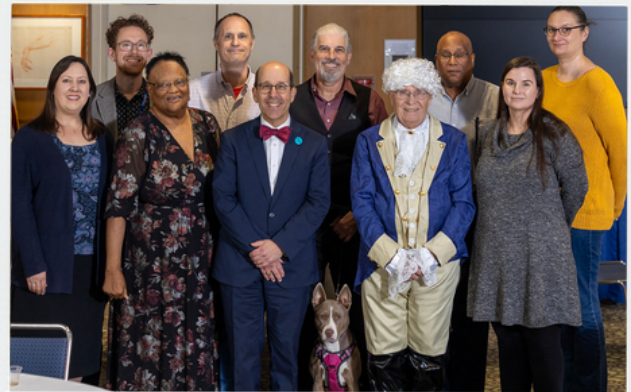
CLASS TAVERN - CELEBRATING 250 TH ANNIVERSARY OF AMERICA