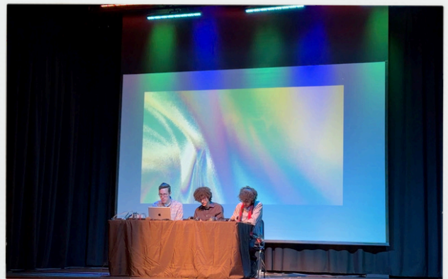
CENTRAL IPAD ENSEMBLE - CELEBRATING CHARLES IVES OCTOBER 18, 2025