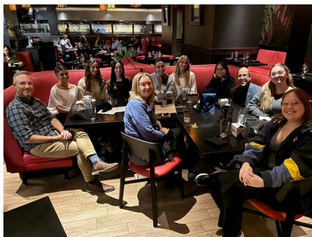
Dean's Dinner for the Living and Learning Community - October 29, 2025 P.F. Chang's, West Hartford

Enjoy our second newsletter, and feel free to reach out with comments or questions: gigliotti@ccsu.edu.