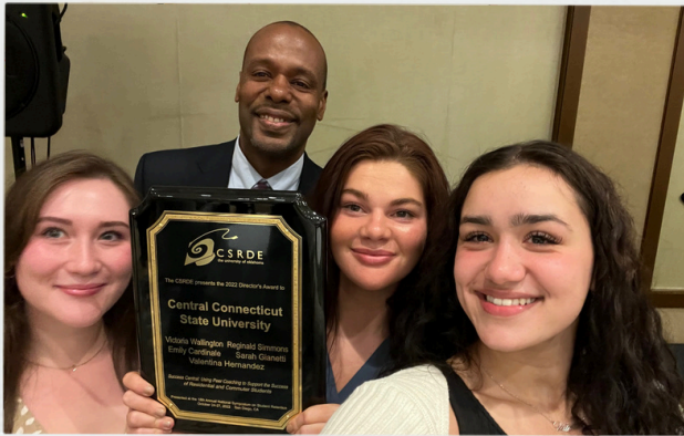
AWARD-WINNING PAPER PUBLICATION IN COLLABORATION WITH SUCCESS CENTRAL SEPTEMBER 30, 2025 SEE STORY ON PAGE 5