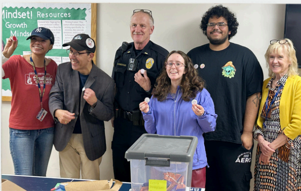
CLLC BUTTON LAB OCTOBER 13, 2025