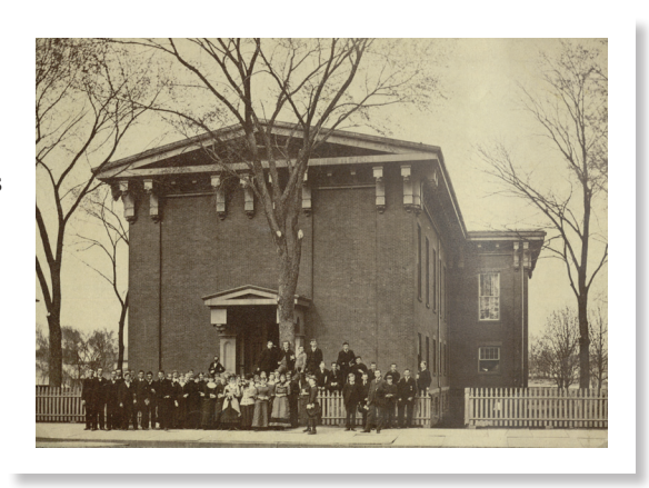
The Normal School - 1849

Initially located in downtown New Britain, the school moved in 1922 to its present campus. In 1933, the Normal School became Teachers College of Connecticut and was authorized to grant four-year