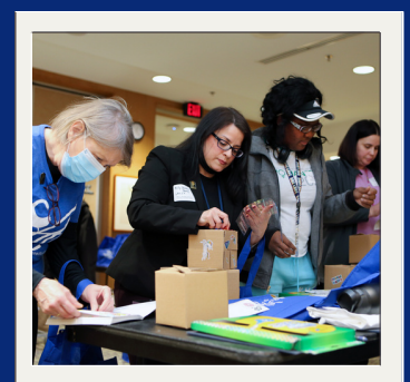
MLK Day of Service: Feminine Hygiene Kits