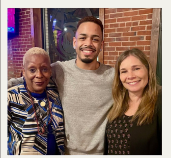
Greater NB Chamber of Commerce 3rd Annual Mardi Gras Raffle