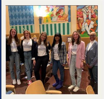
Read Across America with the United Way