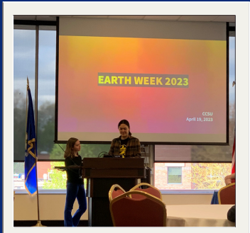
From the Ground Up: Grassroots Movements for Climate Justice Panel Discussion