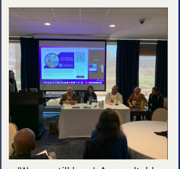
'We are still here': A roundtable discussion with local Indigenous communities