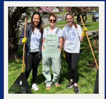
Yard Clean-Up with UR Community Cares