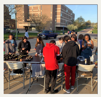
Succulent Potting & Outdoor Movie Night