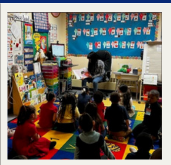
MLK Day of Service: Reading to Smalley