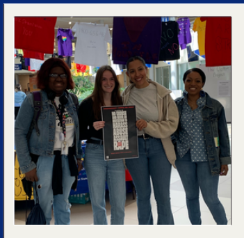
Clothesline Project Unveiling & Denim Day