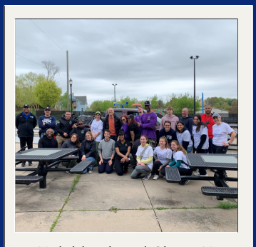
Neighborhood Clean-Up with the North Oak NRZ