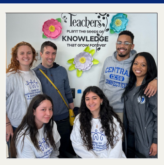
Terrarium building at Smalley Elementary School