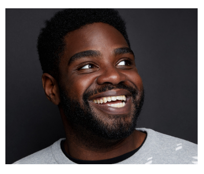
2/10 - Ron Funches