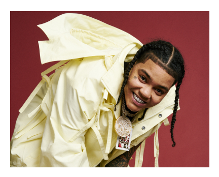
2/17 - Young MA