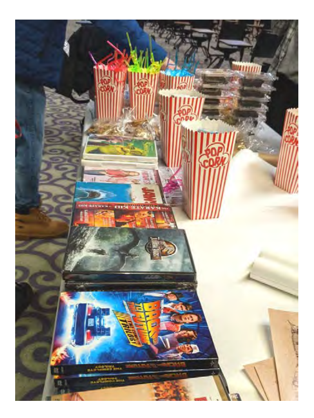
Image from the Blockbuster Trivia Night on February 19 in Alumni Hall