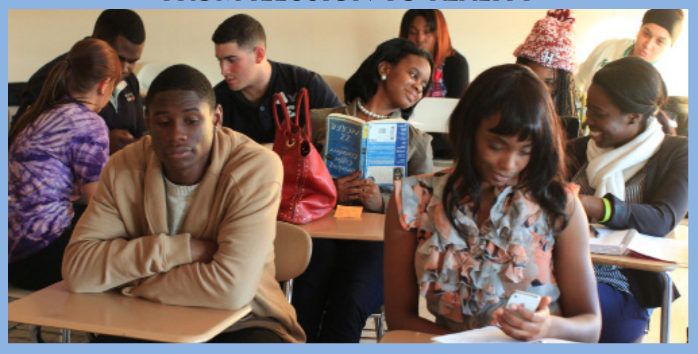
THE VALUE OF HARD WORK FOR CCSU STUDENTS

A Publication of the Center For Africana Studies at Central Connecticut State University FROM ILLUSION TO REALITY