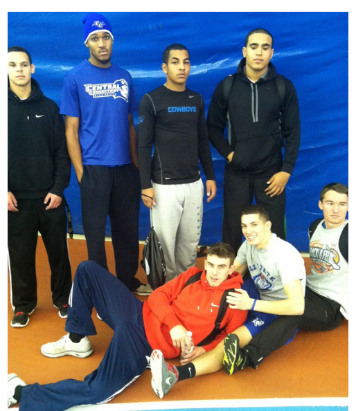
Select members of the CCSU Track Team Relax and pose after campus workout.