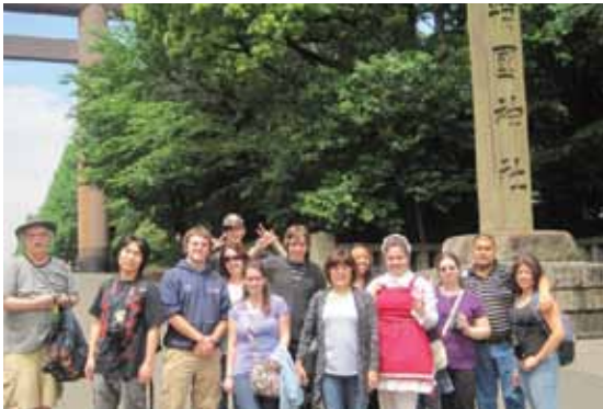
exhibit curiosity and openness toward new opportunities, ideas, and ways of thinking

This program is an amazing opportunity for students to learn about traditional and contemporary Japan. Participants will be mesmerized in Tokyo by Japan's youth and high-tech cultures, while students will be enchanted by the cultural landmarks, traditions, architectural treasures, and gardens in the ancient capital of Kyoto. In Hiroshima and Nagasaki, both cities rebuilt following the destruction of the atomic bombing in 1945, student will learn how these cities now play a significant role in the movement for world peace.