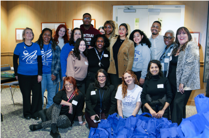
Feminine Hygiene Kits with the Women's Center