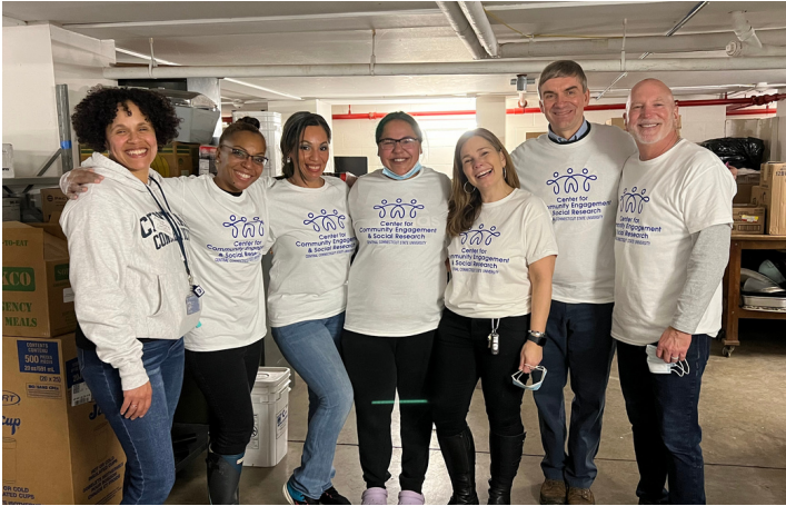
Cleaning and Painting the Friendship Center