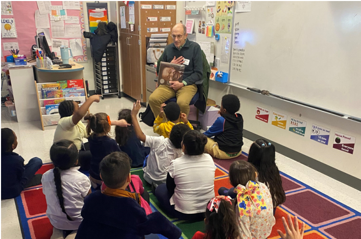
Reading to Smalley Elementary School