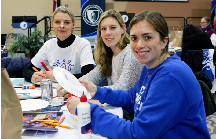
Literacy Kits with the United Way