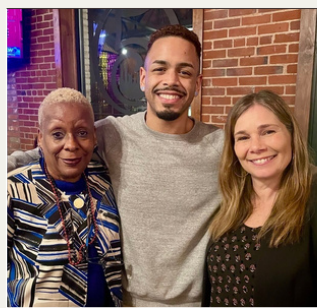
Greater NB Chamber of Commerce 3rd Annual Mardi Gras Raffle