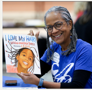
MLK Day of Service: Literacy Kits with the United Way