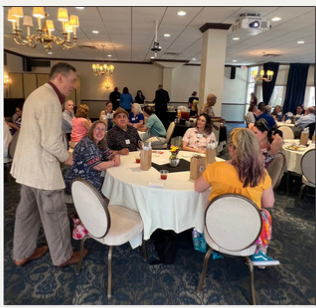
Community Partner Appreciation Luncheon