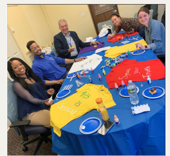
Shirt making for the Clothesline Project