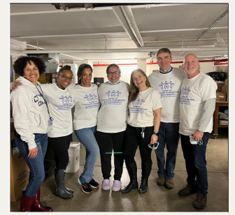
MLK Day of Service: Cleaning the Friendship Center