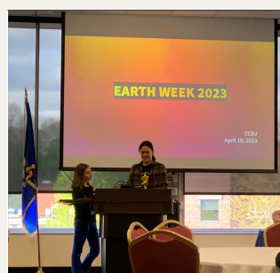
From the Ground Up: Grassroots Movements for Climate Justice Panel Discussion