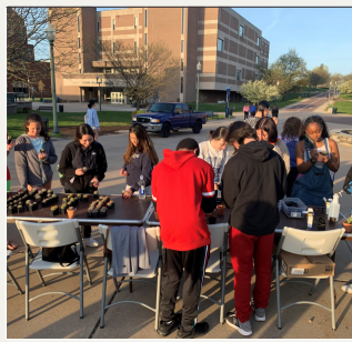
Succulent Potting & Outdoor Movie Night