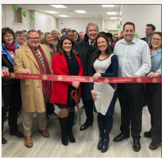
Opening of the Friendship Center's Hope Connection Center