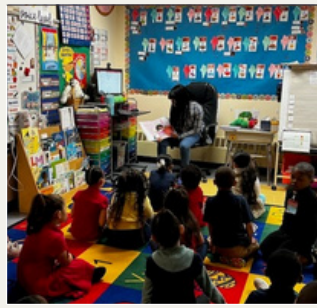
MLK Day of Service: Reading to Smalley