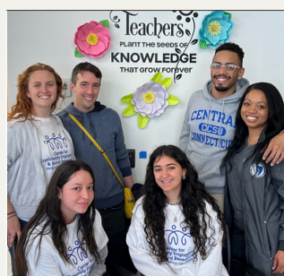
Terrarium building at Smalley Elementary School