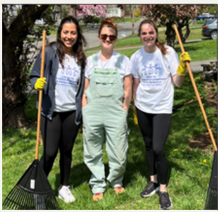
Yard Clean-Up with UR Community Cares