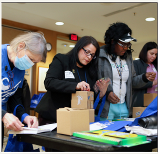
MLK Day of Service: Feminine Hygiene Kits