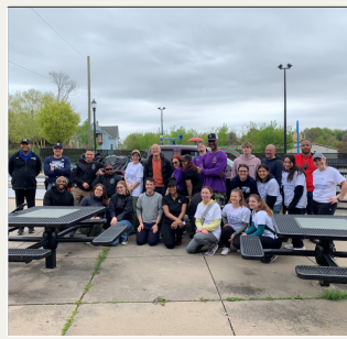
Neighborhood Clean-Up with the North Oak NRZ