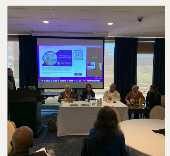
'We are still here': A roundtable discussion with local Indigenous communities