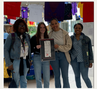
Clothesline Project Unveiling & Denim Day