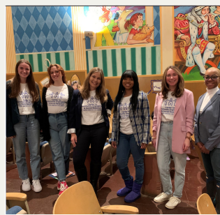
Read Across America with the United Way