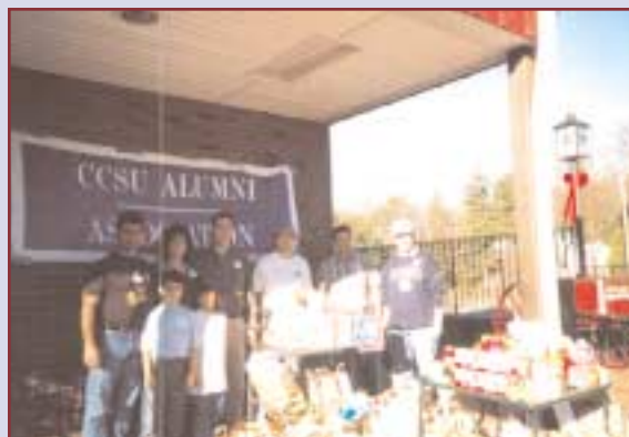
CCSU Alumni gathered together to collect food for a local shelter at Highland Park Market in Manchester on Saturday, December 1.