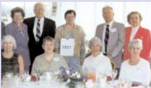
Members of the Class of 1951 gathered for an Awards Banquet.