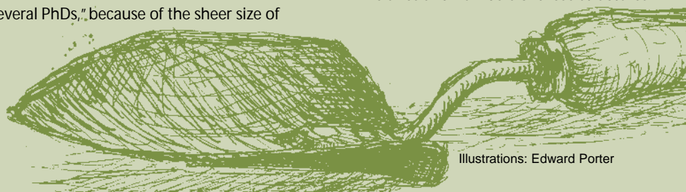
Illustrations: Edward Porter

He has found African-style conglomerations of stone structures on the Salem site that could have served as simple housing. The sizes and numbers of these structures