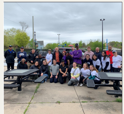
Neighborhood Clean-Up with the North Oak NRZ