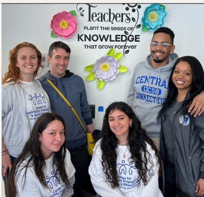
Terrarium building at Smalley Elementary School

For detailed descriptions of the events and activities, click here!