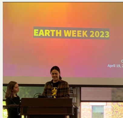
From the Ground Up: Grassroots Movements for Climate Justice Panel Discussion