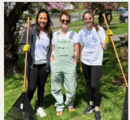
Yard Clean-Up with UR Community Cares