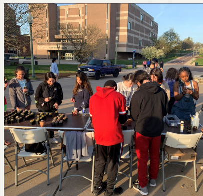
Succulent Potting & Outdoor Movie Night