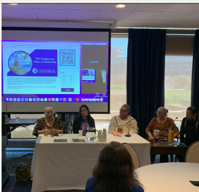
'We are still here': A roundtable discussion with local Indigenous communities