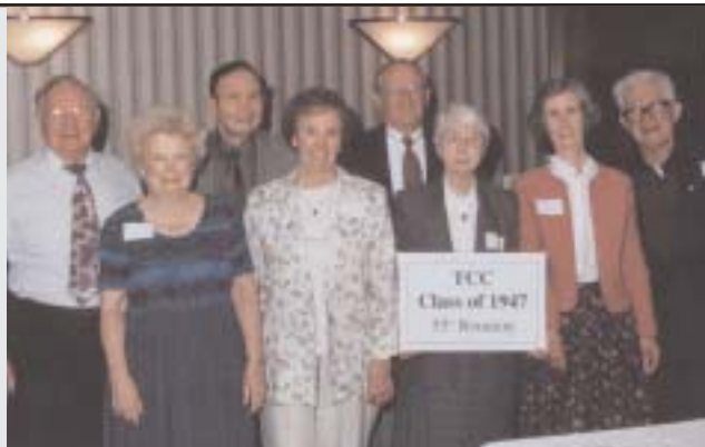
▶ In near photo: the Class of 1947 celebrated the 55th anniversary of their graduation from TCC. In far photo: members of the Class of 1957 met to begin planning their 45th reunion.