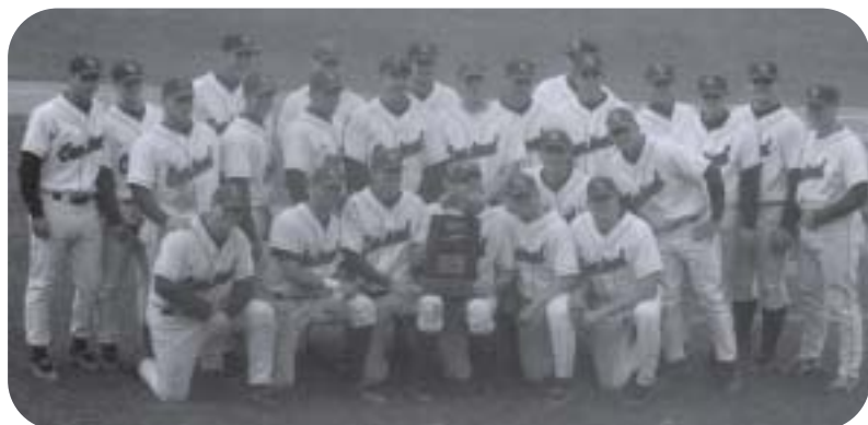
The 2002 Men's Baseball team.