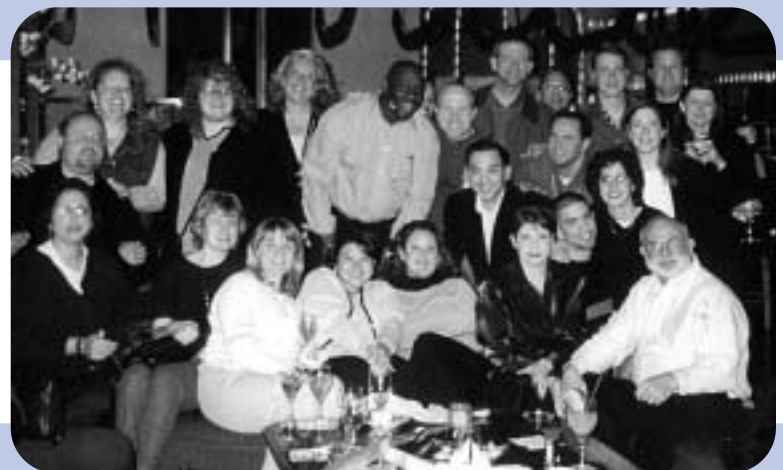
Members of "the firm" at a recent reunion of the CCSU Student Union Alumni at the 80th Association of College Unions International Conference at the Marriott Marquis Hotel, New York City in March, 2000.